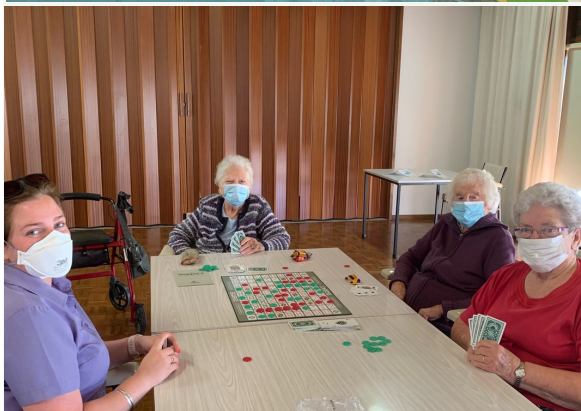
Pictured (from top): Pattinson House residents playing Wheel of Fortune and (centre) an indoor fishing game; (bottom) Ouyen PAG members getting a game in during their recent meeting at the Senior Citizen's building.